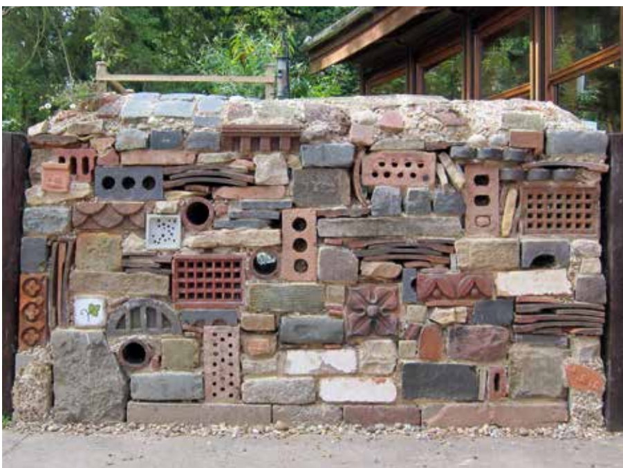
Habitat Wall at the WWT Parkridge Centre in Bruton Park