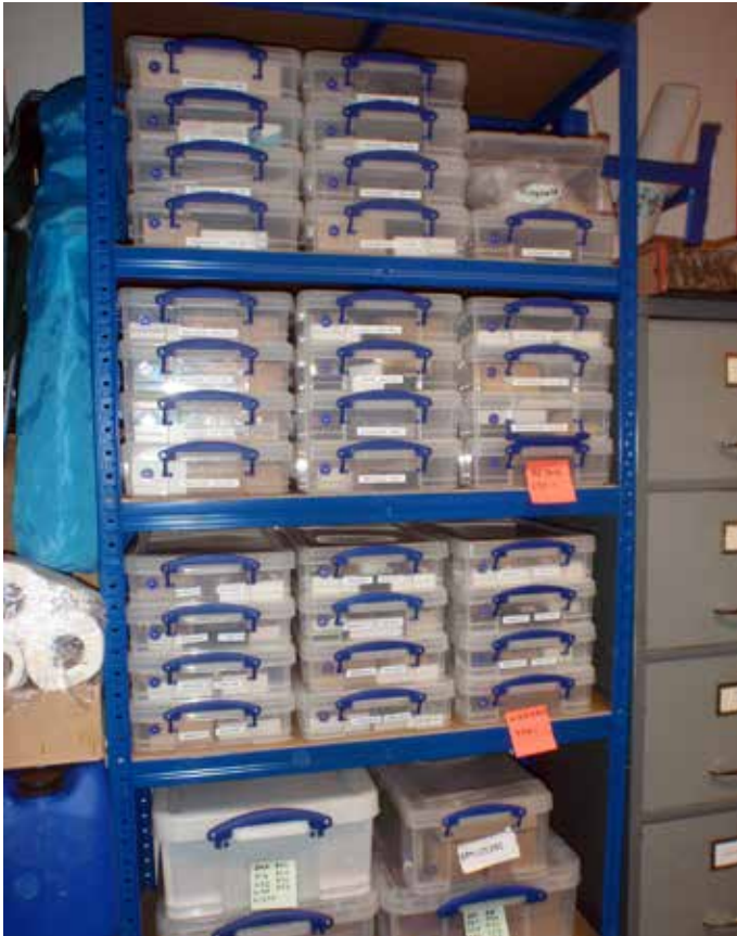
Organised storage of the collection in the office

As you will probably be aware, our benefactor, Rob Holloway, spent most of his leisure hours visiting sites of geological interest and built up a large collection of rocks, fossils and minerals. When Open Studies teaching closed at Warwick University, much of the collection