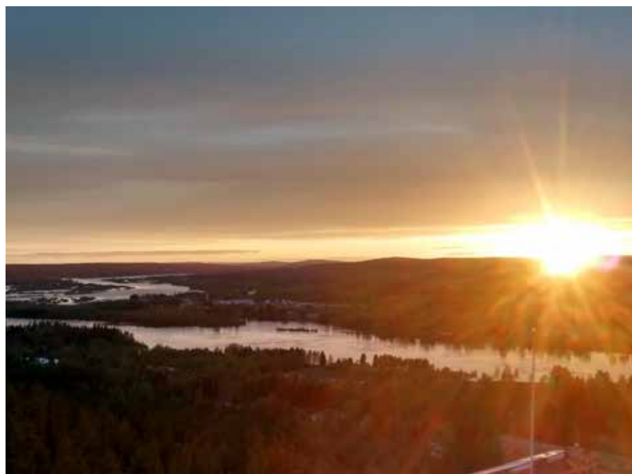
Midnight Sun - Rovaniemi

Following exams, the MSc culminates in producing a dissertation, which can focus on any geological or mining topic. After contacting the Geological Survey of Finland, I chose to undertake an academic project and study an enigmatic PGE deposit in northern Finland. Previously unstudied, the Sotkavaara Intrusion and associated mineralisation has provided an exciting research opportunity, which has further fuelled my desire to pursue an academic career. After travelling to Rovaniemi, Lapland (the home of Santa Claus), I spent 4 weeks logging cores, conducting optical microscopy and studying geochemical data. Additional to the exciting geological challenges encountered at the Geological Survey of Finland, 24-hour