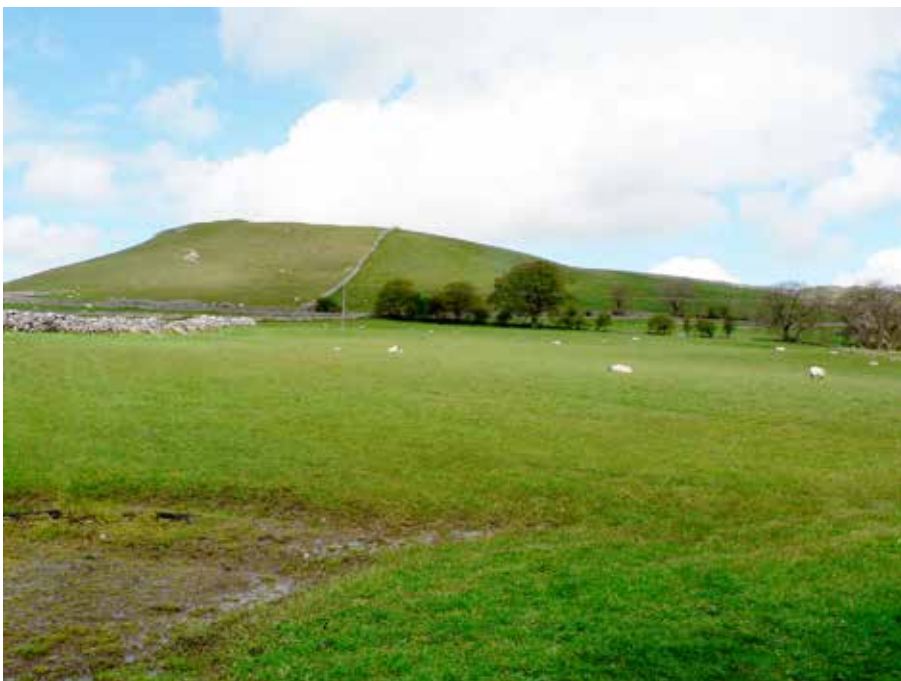
Cawden Reef Knoll

We all met at our comfortable stone built hotel, Beck Hall (front cover) in the village of Malham, to be ready for a 2pm start. Already the dramatic nature of the landscape was evident and our first walk (6 km.) direct from the hotel was a classic introduction to the features of 'karst' that were to become familiar to us over the weekend.