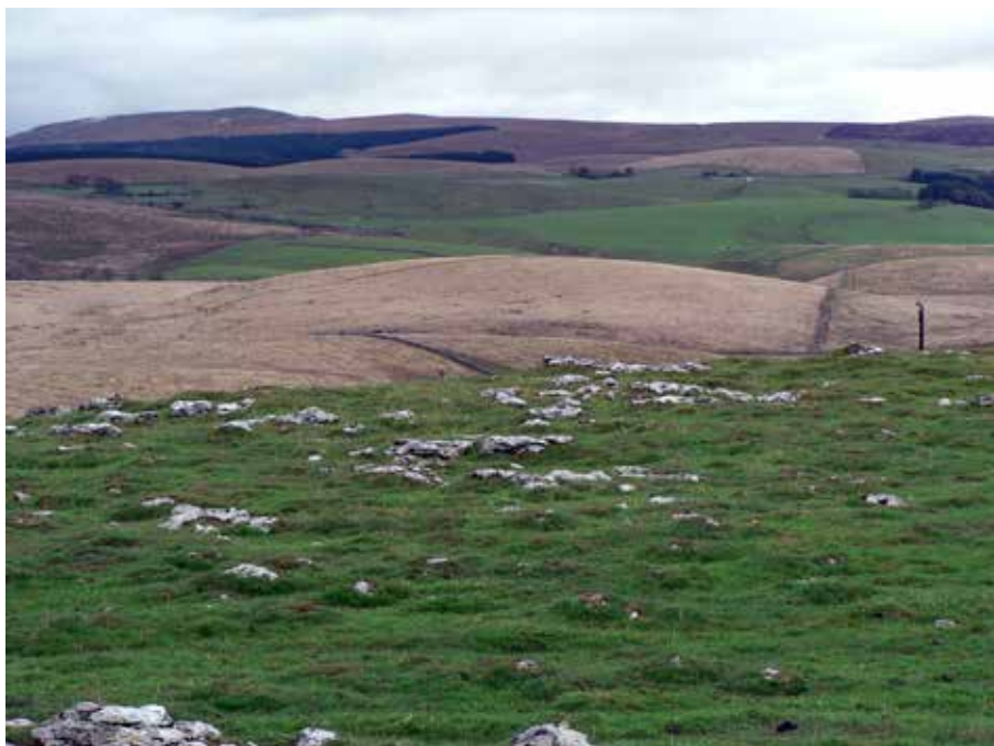
Ribble valley drumlin

This was for me a day of new words, but explanations were given and they had become familiar by the end of the next two days. The first of these was 'drumlins', a collection of small oval hills, described as being like a 'basket of eggs', made of till which had been left by the retreating glacier.