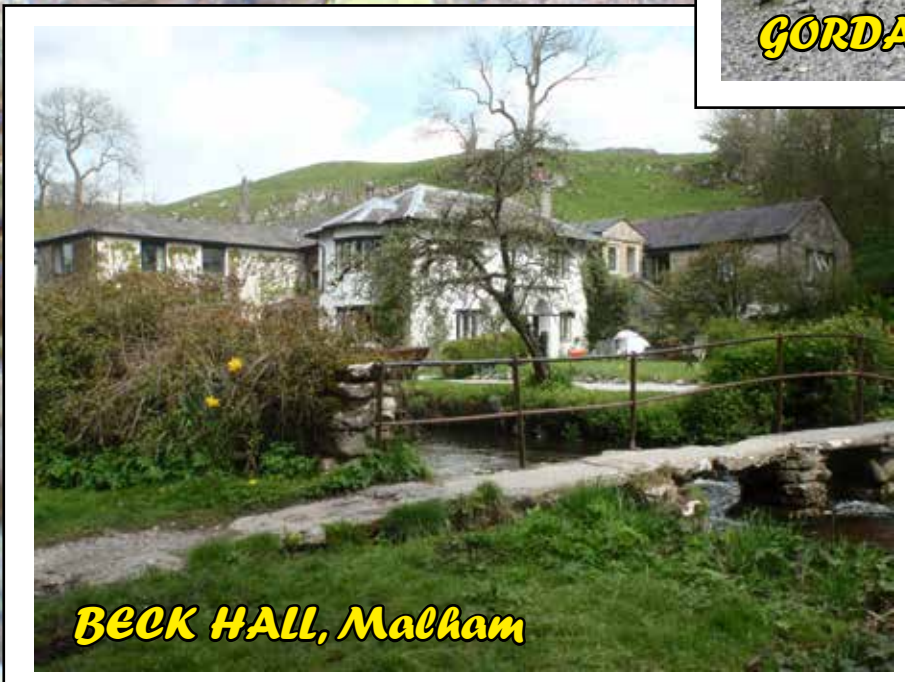
BECK HALL, Malham