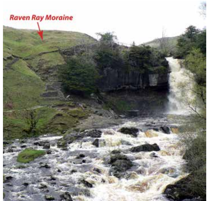
Raven Ray Moraine

Below the bend of the river a waterfall, the Thornton Force, emerged, swelled by yesterday's rain. This was scenic spot to eat a packed lunch before turning off to the road and back to the cars.