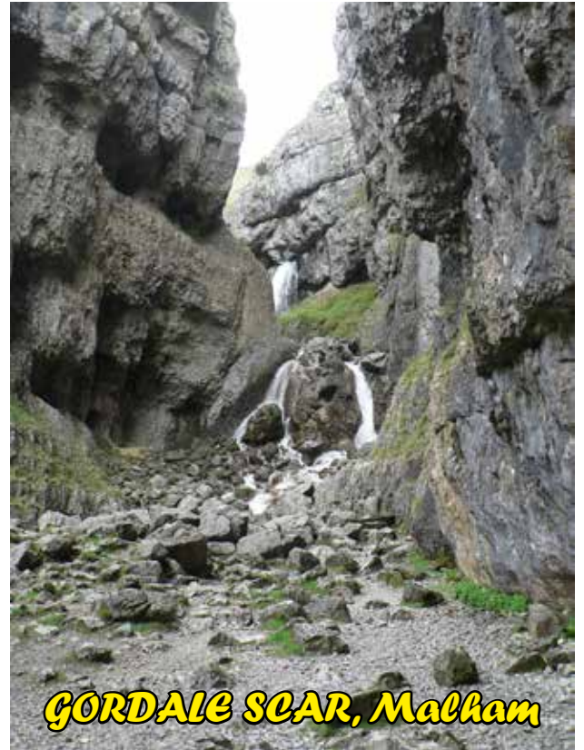
GORDALE SCAR, Malham