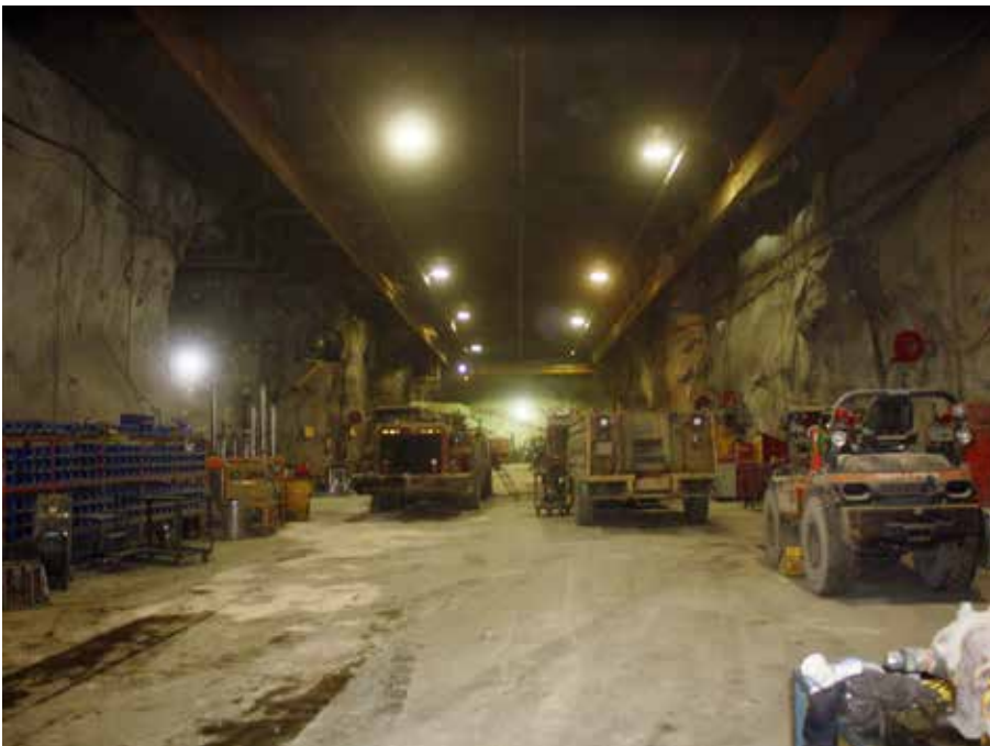
Kidd Mine at a depth of 2km

In September 2014, I started studying a masters in Mining Geology at Camborne School of Mines, University of Exeter, after being awarded £2,500 from WGCG. In September 2015, I will start a PhD at Cardiff University- something achieved as a direct result of the Holloway Award. This article gives a brief account of selected experiences in the last 12 months. As I cannot hope to describe the plethora of learning experiences in this article, I will focus on key trips to Canada and Finland.