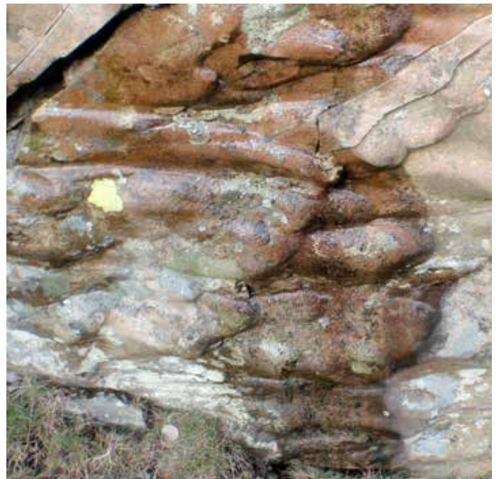
Sole structures in turbidites